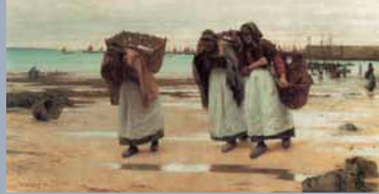
Breadwinners, watercolour by Walter Langley

Venue: Borlase Smart Room, Porthmeor Studios, Back Road West, St. Ives.