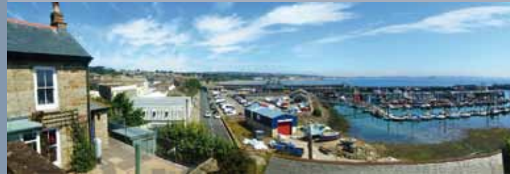
Visit artist's studios in Newlyn and see where historic pictures were painted.