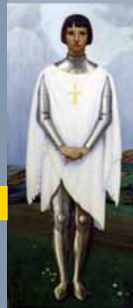
See the art in St. Hilary church