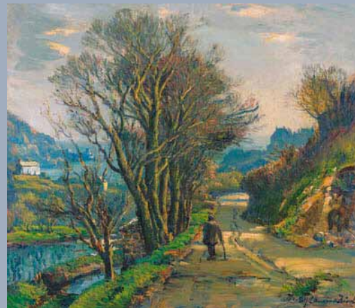
Visit the magical Lamorna Valley